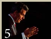
5 Richard Florida Message Empowers