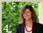
4 Foundation Welcomes Director of Development