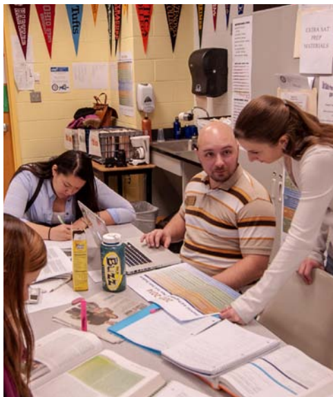
Students who participate in The Young Scholars program receive tutoring and guidance during the school day at Thomas R. Proctor High School in Utica.

Young Scholars, a program that provides college readiness tools and skill for students at risk of dropping out of high school, received the most votes. With the $500, Young Scholars will give 16 students the opportunity to attend two intensive writing camps.